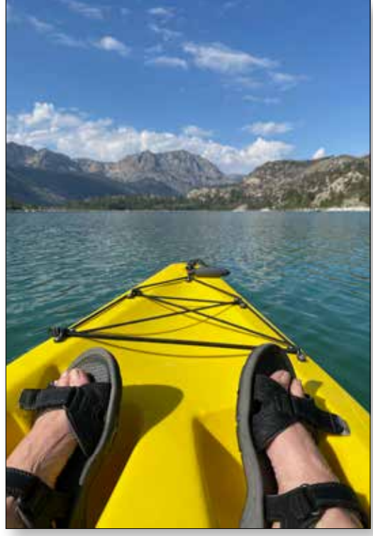
The Writer on June Lake

When the clock struck 8:15 a.m., the husband and I took off for June Lake. I wanted to spend a few hours on a kayak with my love, floating on one of the most beautiful lakes reachable by car in the Eastern Sierra.