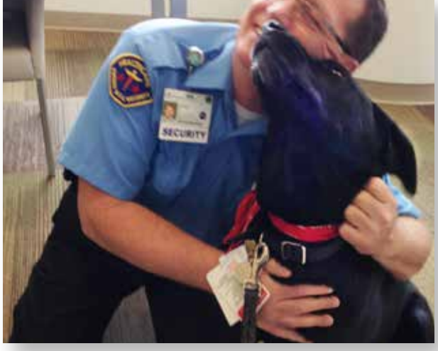
Spreading care to staff and patients

help children develop seven core social behaviors through engaging activities. The core behaviors focused on are attachment, empathy, self-regulation, affiliation, respect, confidence, and tolerance. It has been proven that through these activities that target specific core behaviors, a positive change occurs in the participating youth.