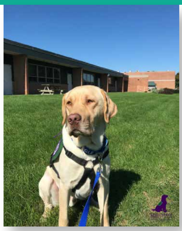
Eagle the Service Dog goes to School

One of Eagle's favorite jobs is working with small groups of striv-