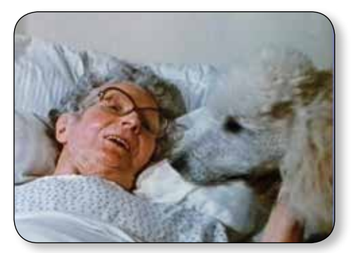
Extra Tags: childhood development, empathy, heal, gentle touch, veterinary medicine, animal welfare, child abuse, animal abuse, family violence, child protection, animal cruelty,

Emphasizes the importance of animals in early childhood development and education. It compares children who experience the companionship and love of animals with those who don't, and examines the psychological nuances and effects from both sides of the Human-Companion Animal Bond. (24 minutes)